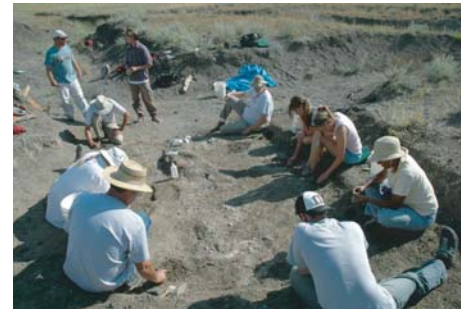
Marmarth dig, 2006