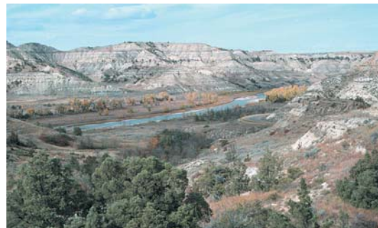
Sentinel Butte Formation

*Preregistration is required. Payment is due at time of registration. Participants ages 14-17 must be accompanied by a paying adult. Registration ends June 1. Moderate to strenuous hiking required. Rain or shine.