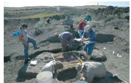
Marmarth dig, 2006

*Preregistration is required. Payment is due at time of registration. Participants ages 14-17 must be accompanied by a paying adult. Registration ends June 1. Moderate to strenuous hiking required. Rain or shine.